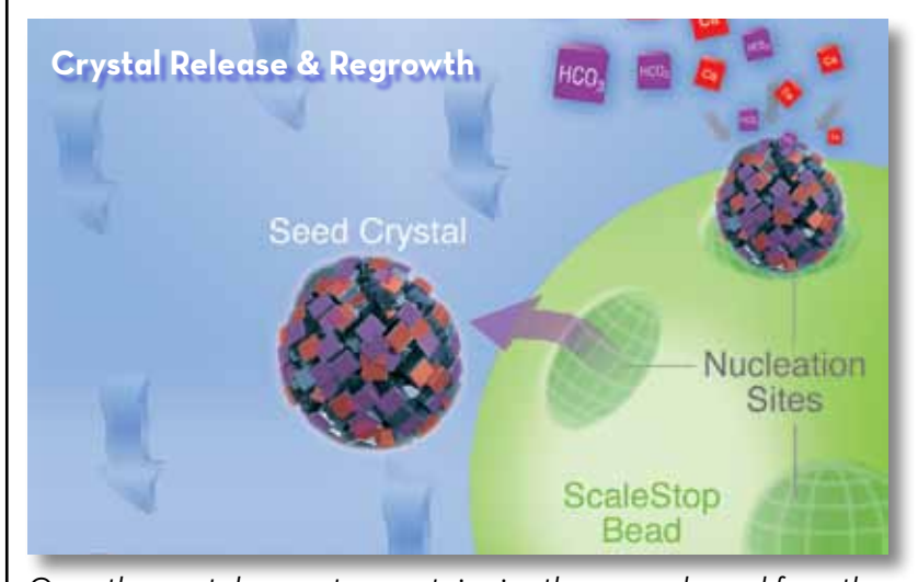
Once the crystals grow to a certain size they are released from the bead. The crystals in solution keep the hardness out of the water so that it can't form scale or interfere with soap.